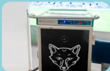
Leicester City FC